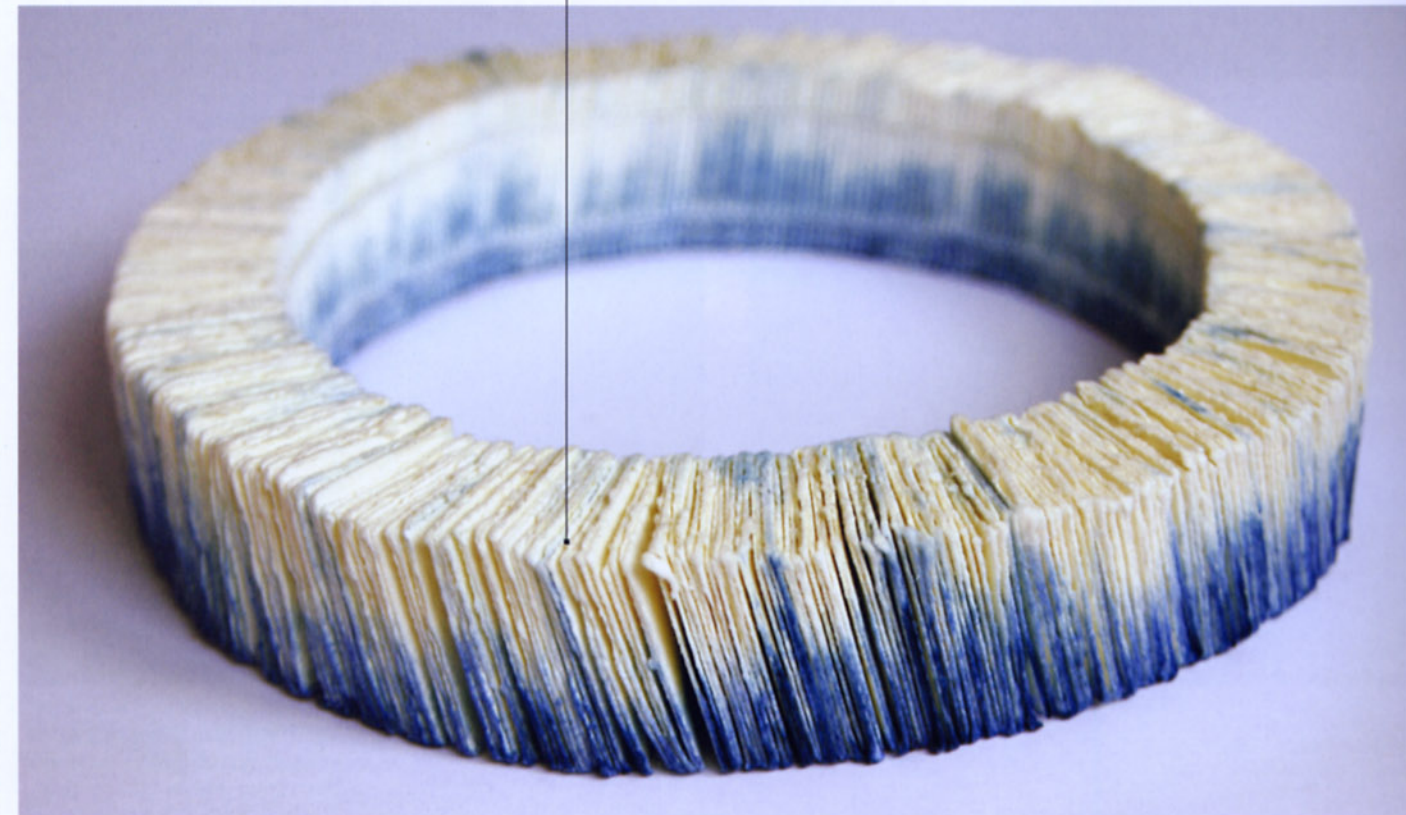
Book or necklace?